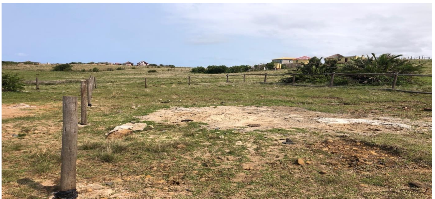
Proposed vegetable garden at Sunshine creche